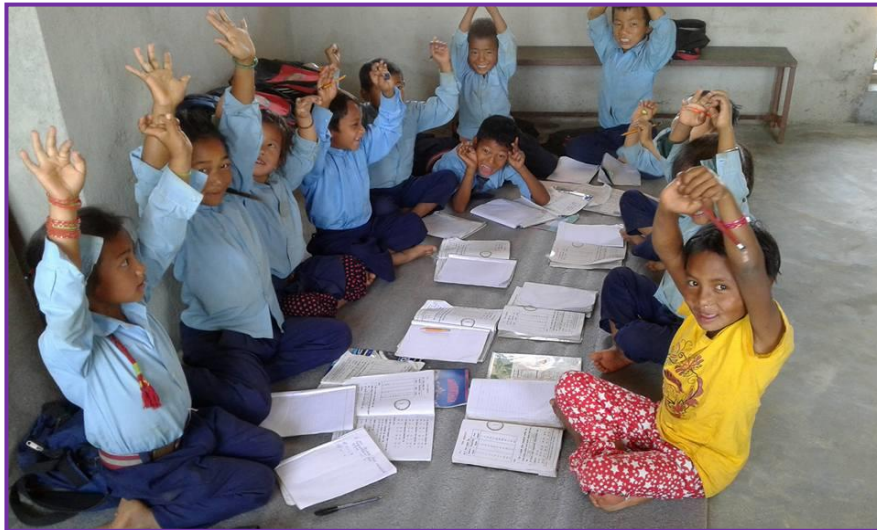
ECD and School Support Projects, Sindhupalchok, Nepal