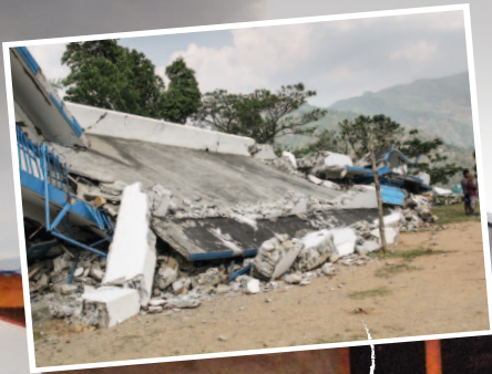
Kadambas school after the earthquake

This structure withstood 2 major earthquakes and 500 aftershocks thanks to the earthbag building technique, earthquake-resistant. (Photo taken 2 weeks after the last quake)